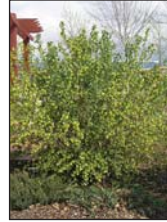
Alpine Currant Ribes alpinum 'Green Mound'