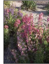
Rondo Mix Penstemon Penstemon barbatus var. praecox f. nanus 'Rondo'