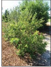
Dwarf Serviceberry Amelanchier alnifolia var. pumila