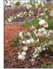
Snowberry Symphoricarpos albus