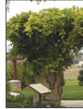
Wisteria Wisteria sinensis