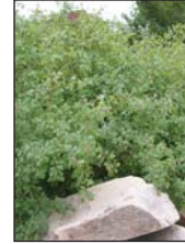
Gro-Low Sumac Rhus aromatica 'Gro-Low'