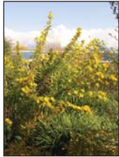
Maximilian Sunflower Helianthus maximiliani 'Santa Fe'