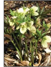
Lenten Rose Helleborus orientalis